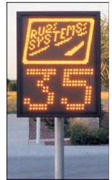
Full Graphics Capability Static & Scrolling!