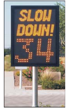
"SLOW DOWN" Violator Alert

Several Violator Alerts are available including an embedded "SLOW DOWN" message in red LEDs, our unique flashing Red/Blue bars, particularly effective at night make for some interesting Violator Alert combinations. The Fast-475 can also be equipped with various sophisticated 3rd party timing apparatus for complete school year preprogramming.