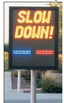
"Red/Blues" Violator Alert - Optional