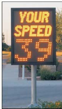
Speed Feedback Sign