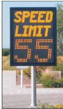
Variable Speed Limit (VSL)