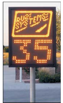
Full Graphics Capability Static & Scrolling!