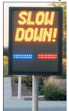
"Red/Blues" Violator Alert - Optional