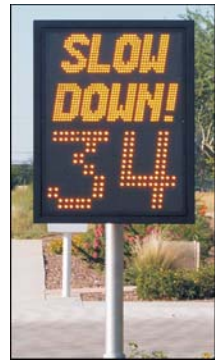
"SLOW DOWN" Violator Alert

Several Violator Alerts are available including an embedded "SLOW DOWN" message in red LEDs, our unique flashing Red/Blue bars, particularly effective at night make for some interesting Violator Alert combinations. The Fast-475 can also be equipped with various sophisticated 3rd party timing apparatus for complete school year preprogramming.