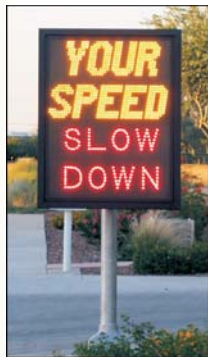
"SLOW DOWN" Violator Alert - Optional

Perhaps the most versatile sign available in Traffic Calming today, the new RU2 Systems Fast-475 pole mount Driver Speed Feedback Sign, these high intensity LED displays get the full attention of oncoming drivers. Hard-wired to your electric service or optionally powered by solar power these signs will perform years of yeoman duty.